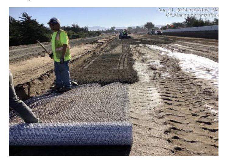
The roadway design includes the use of "geo-grid" which adds strength and stability to the material beneath the asphalt surface