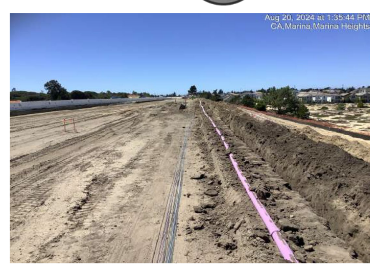
Trenching for irrigation service lines. Purple pipe is for recycled water use.