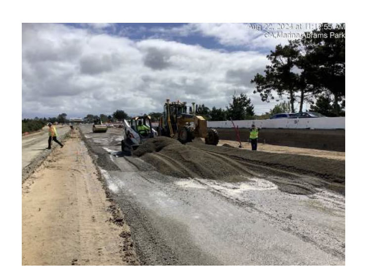
"Base rock" is installed on top of the geo-grid and is graded, then compacted. Asphalt will be the final layer on top of the base rock section.