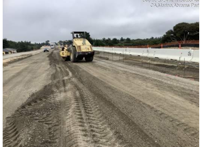
Grading and compaction activities on roadway section between Abrams Drive and Marina Heights Drive