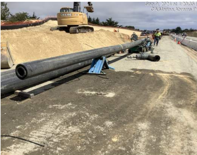
Dual-walled HDPE pipe sections for the Army's treated groundwater system