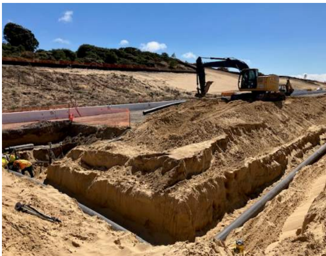
Pipe sections installed in the trench