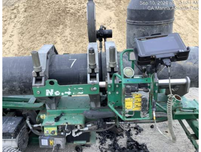
Fusion machine uses heat and pressure to join pipe sections together (instead of mechanical joints)