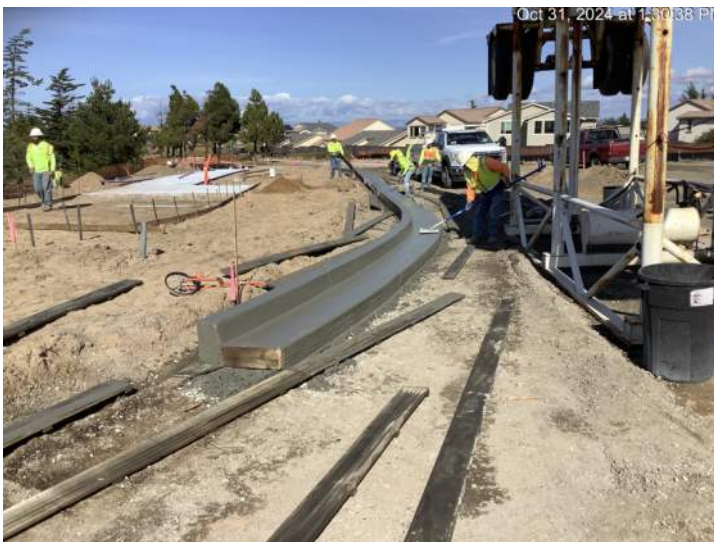
CURB AND GUTTER WORK AT MARINA HEIGHTS DRIVE