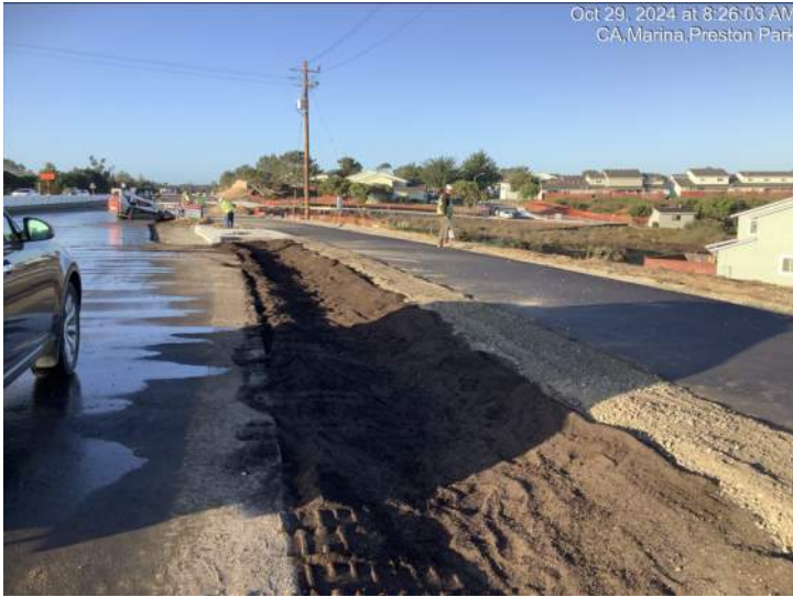
SPECIAL SOIL MATERIAL (DARK SOIL) INSTALLED FOR BIO SWALES WHICH HELP CONTROL STORM WATER RUNOFF