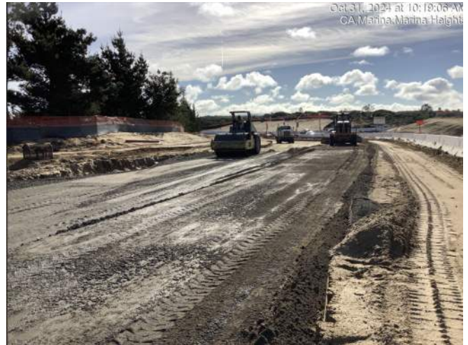
GRADING AND COMPACTING BASE MATERIAL FOR PHASE 1 ROADWAY NEAR IMJIN ROAD