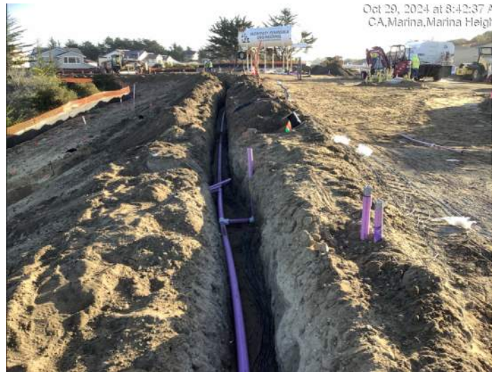
INSTALLATION OF SERVICE LINES FOR IRRIGATION (PURPLE PIPE INDICATES RECYCLED WATER USE)