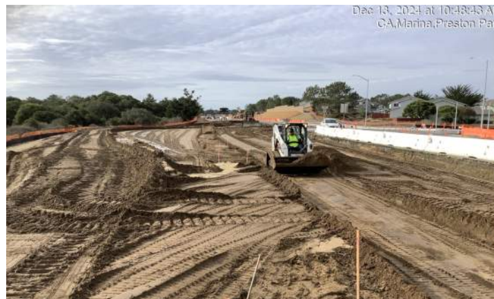
Embankment fill work across from Preston roundabout