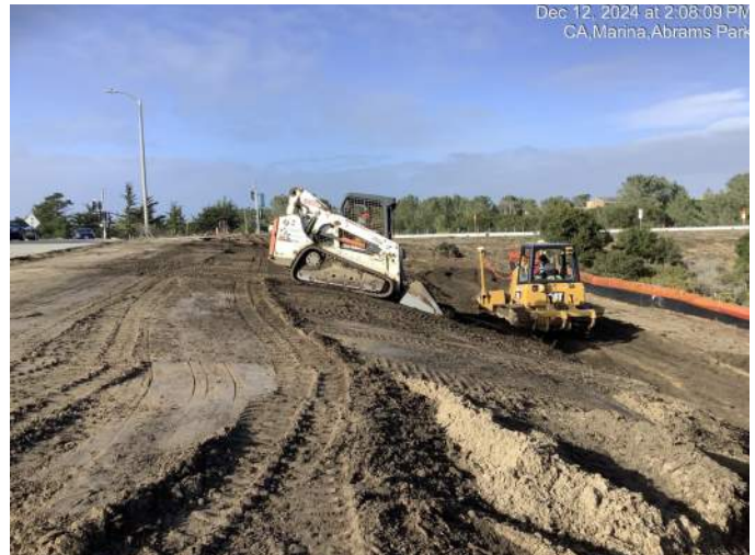
Embankment fill work at southeast corner of Preston Drive