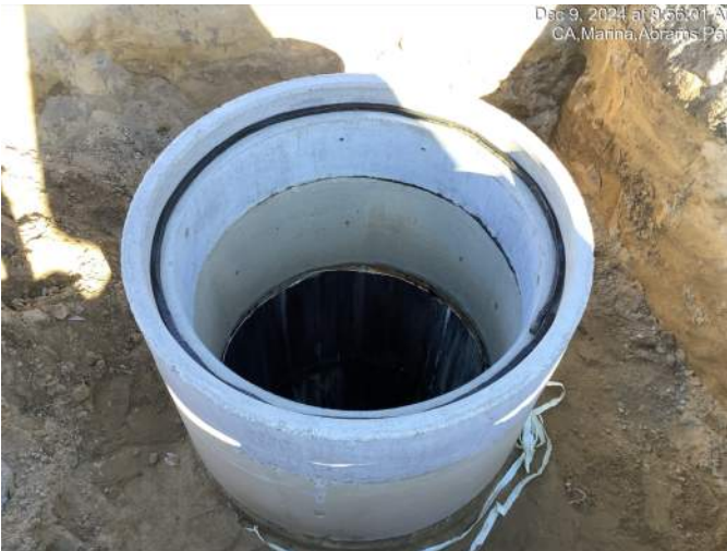
New barrel section for sewer manhole