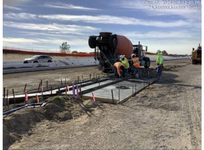
Driveway (for maintenance vehicles) west of Marina Heights Drive