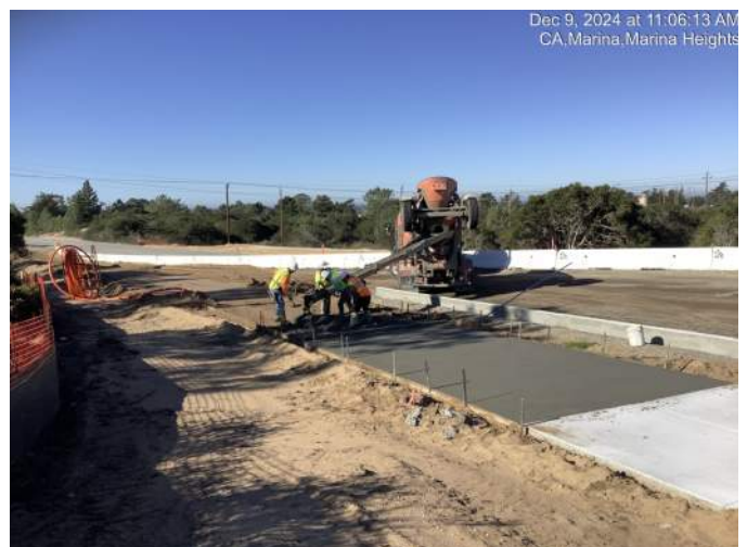
Sidewalk concrete along Imjin Road