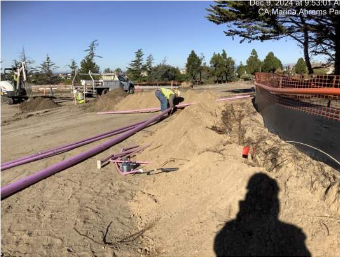
Installing irrigation pipe on Marina Heights Drive