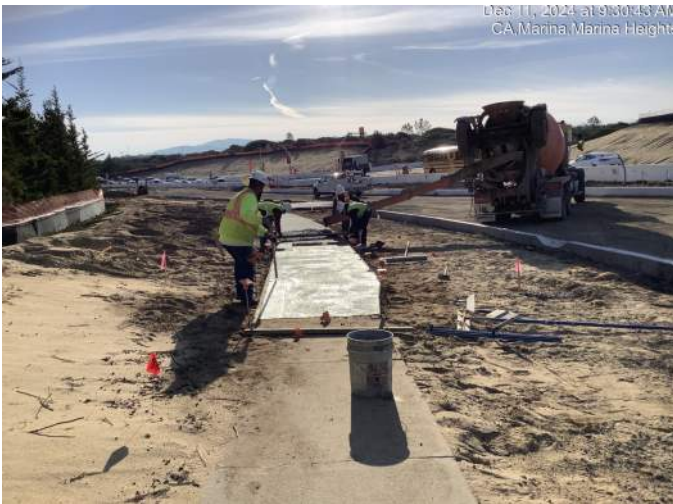
New sidewalk tying into existing west of Imjin Road