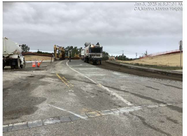
Grinding/removal of existing asphalt roadway on Imjin Road.