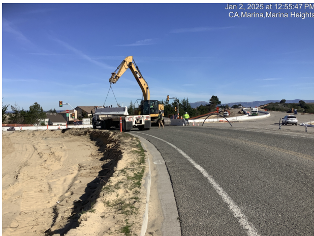
Closing of Imjin Road at Imjin Parkway