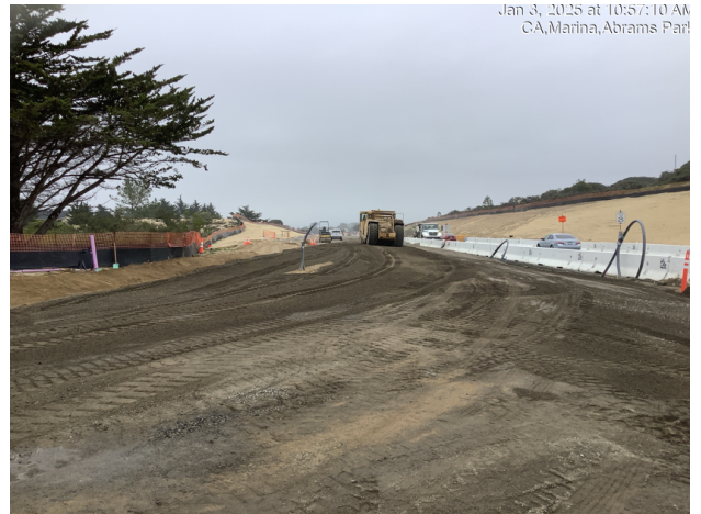
Importing base rock for the roadway section at Marina Heights Drive