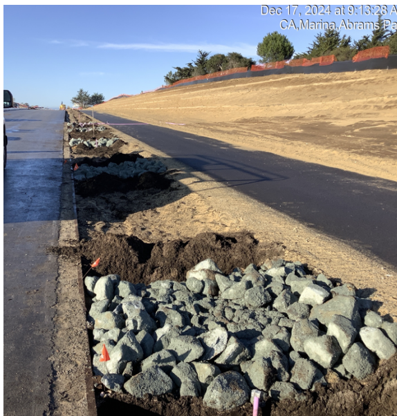
Rock check dams in bioretention feature - the bioretention areas are designed to absorb/treat run-off water through the use of plantings and special soil rather than conveying runoff through the storm drain system.