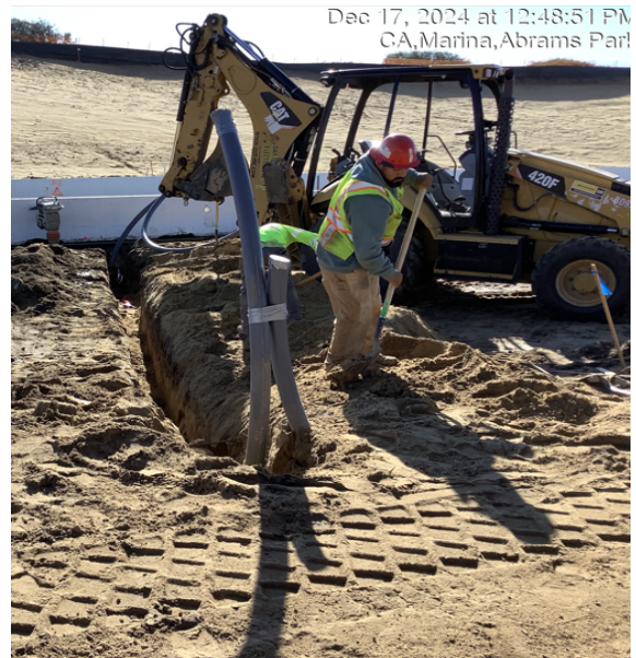
Installing street light conduit for the street lights that will be in the median area of Imjin Parkway.