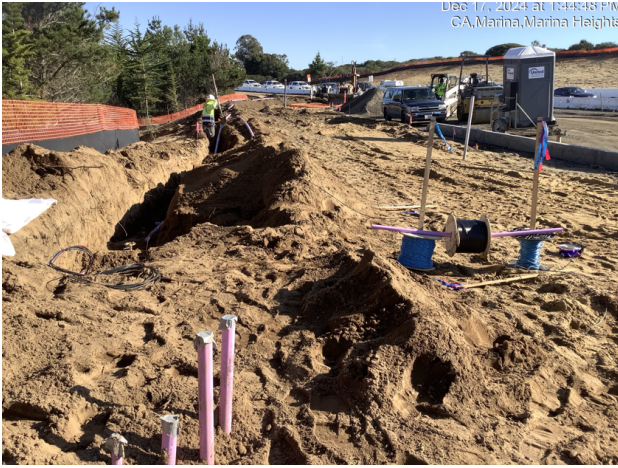
Installed irrigation pipes in the foreground. Purple pipe indicates the use of non-potable recycled water.