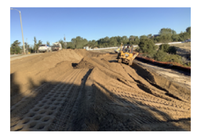
Embankment grading at SE Abrams Drive