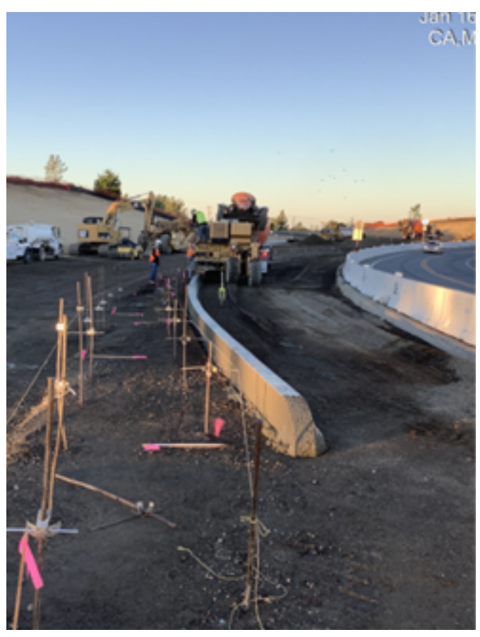
Extrusion machine extruding median curb along Imjin Parkway near Imjin Road