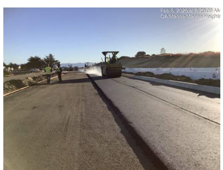
Paving operation for first lift of asphalt on Imjin Parkway westbound lanes - from western job limit (between Abrams Drive West and Imjin Road) to the 1/2 roundabout at Marina Heights Drive.