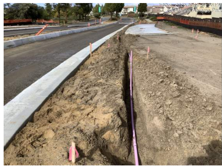
Installing irrigation service lines along Marina Heights Drive