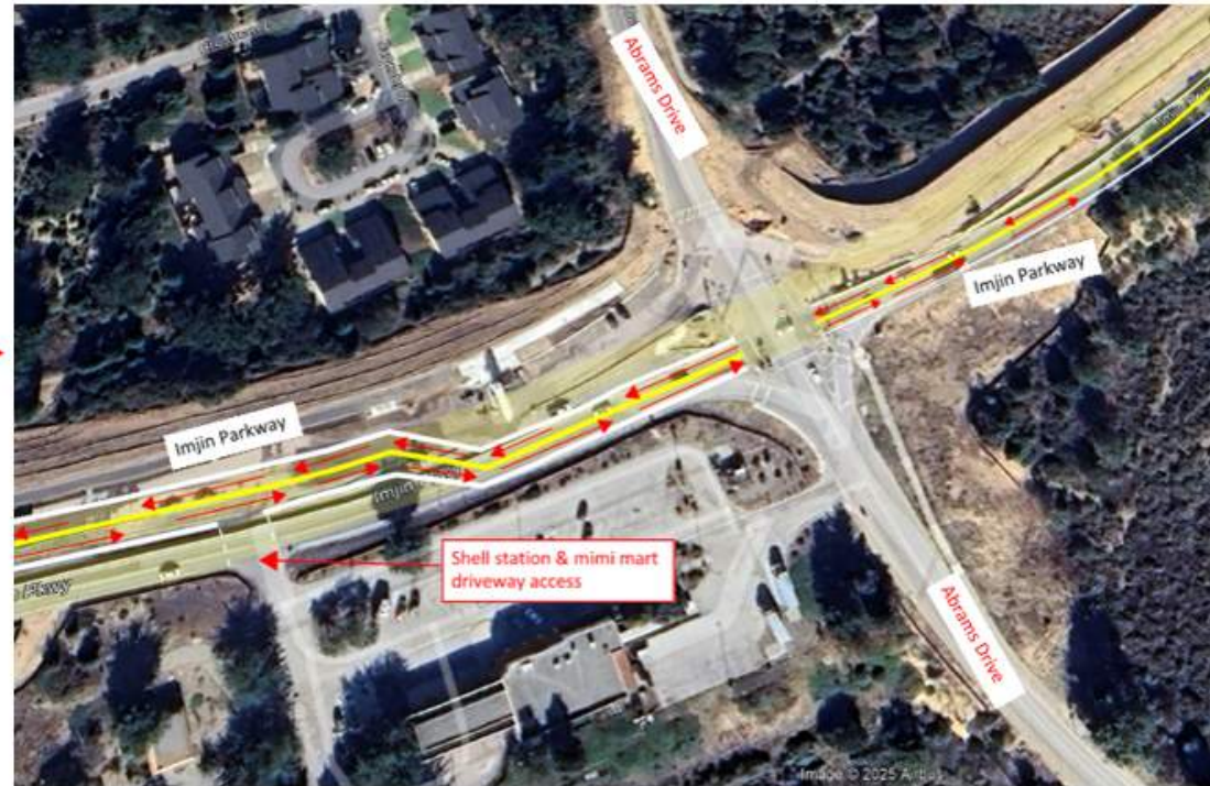
NEW PHASE 2 TRAFFIC FLOW