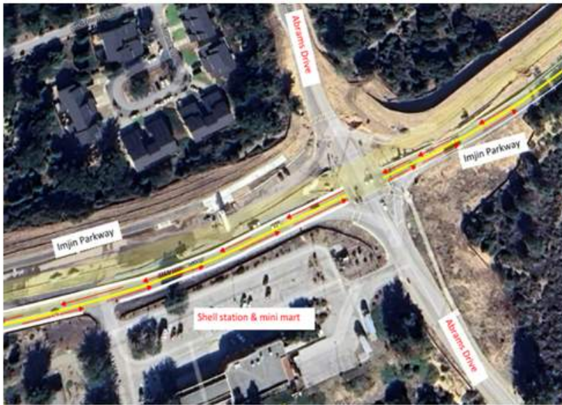
EXISTING TRAFFIC FLOW

IMJIN PARKWAY WIDENING & ROUNDABOUT PROJECT