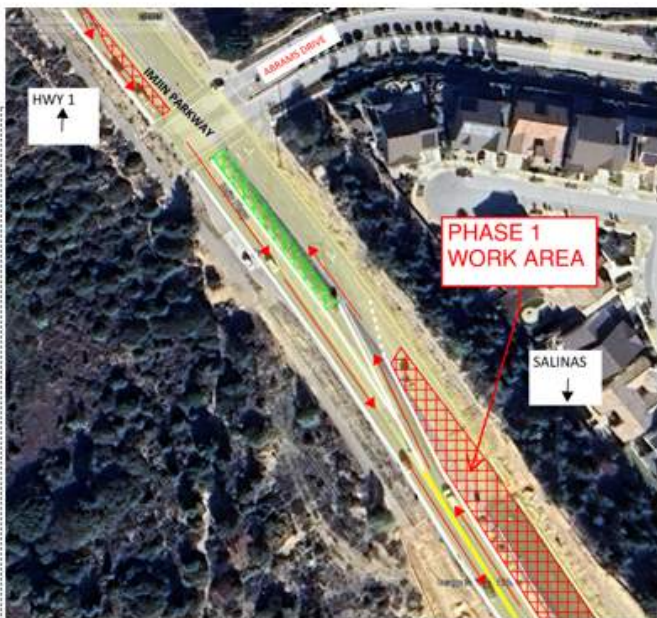
EXISTING TRAFFIC FLOWS