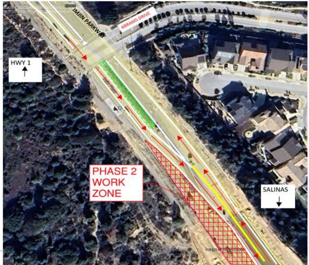
NEW PHASE 2 TRAFFIC FLOWS